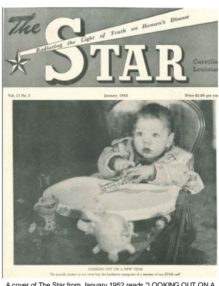
A cover of The Star from January 1952 reads "LOOKING OUT ON A NEW YEAR We proudly present as our cover boy the handsome young son of a member of our STAR staff". Patients and Staff at the Carville Hospital had close relationships, and often celebrated Christmas, Mardi Gras, weddings and other events together.

Contradicting the misinformation about leprosy was needed. In the 1890's, residents of New Orleans were terrified to learn that a treatment center for leprosy could be located in their city, so a more isolated location was selected. Even in the isolated setting, the lease of a plantation in Carville was done under the pretense that it was going to be an ostrich farm ^2 .